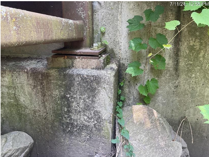
Minor map cracks at West abutment, North bearing