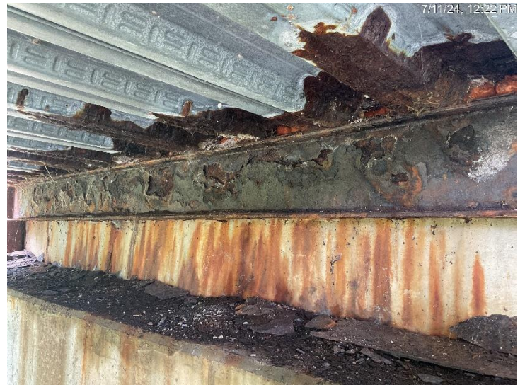
Severe corrosion at north floor beam