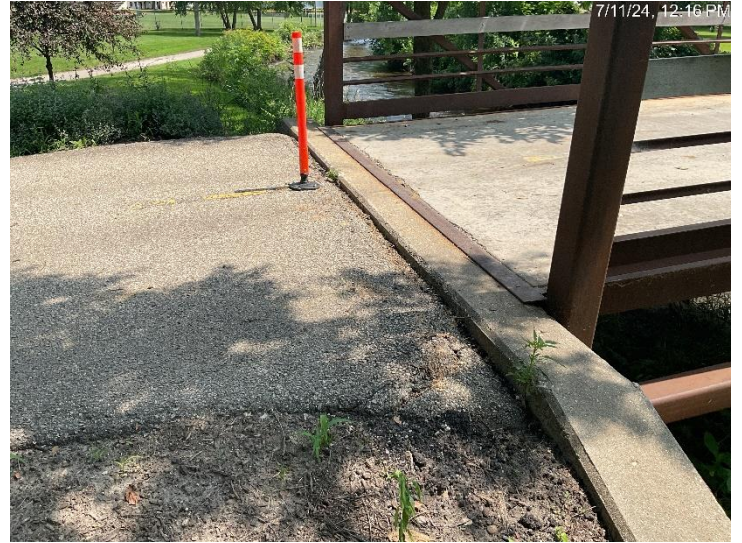
North approach pavement settlement