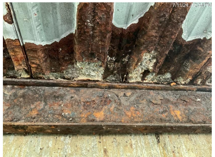
Concrete spall/exposed reinforcing steel at North SIP forms