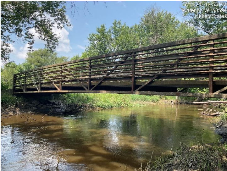
South elevation view