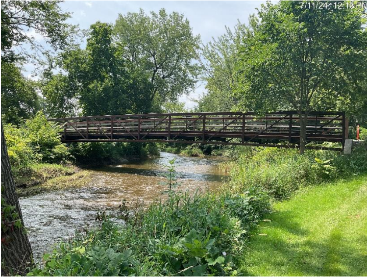
East elevation view