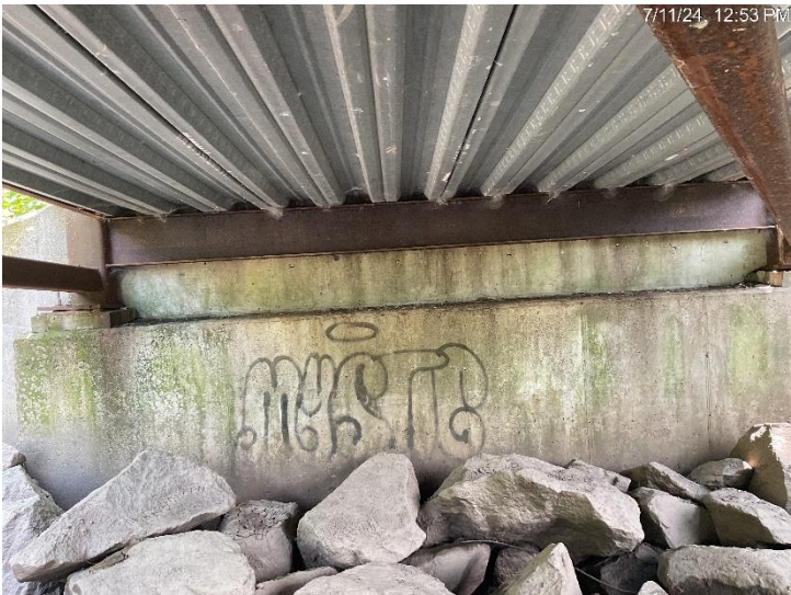
West abutment and floor beam typical condition