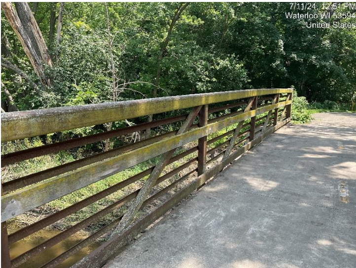
Typical algae growth on rails and truss