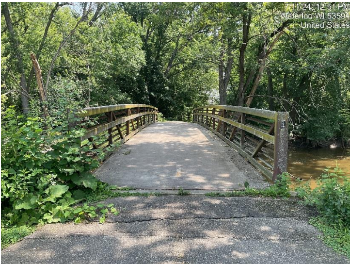
West approach pavement and longitudinal view looking East