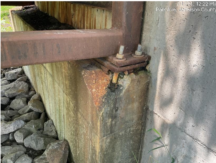
North abutment spall at northeast bearing plate