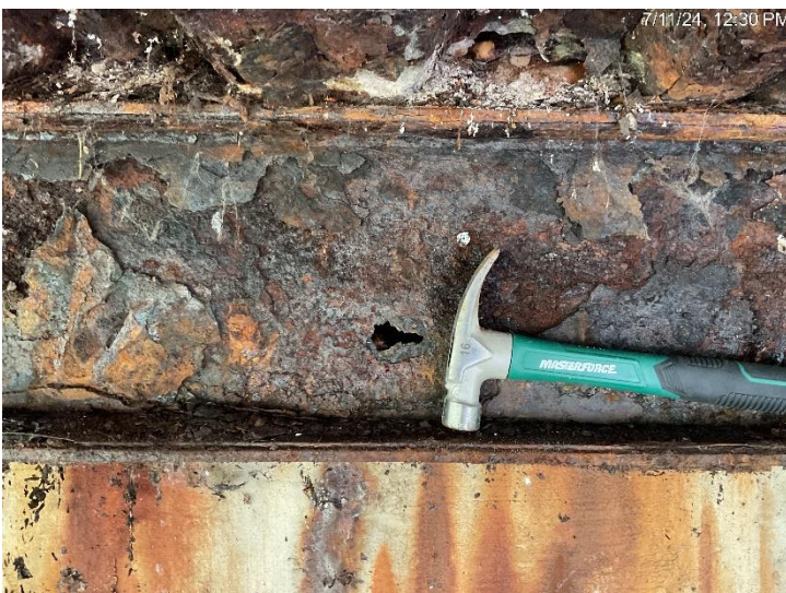
Section loss and corrosion at North floor beam