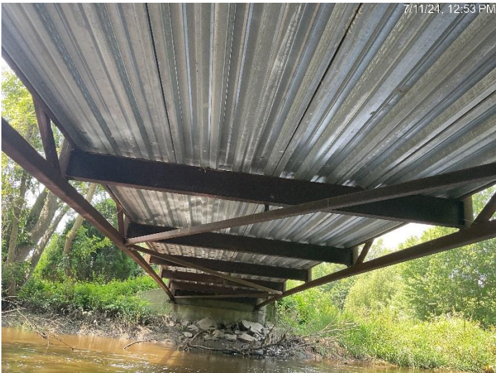
Typical view of SIP and truss lower cord